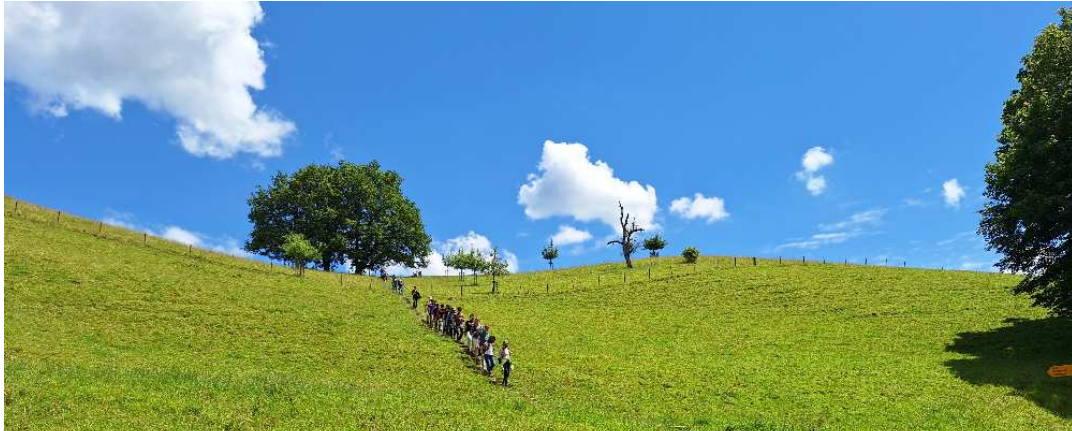
Institute Hike 2024, close to Lenzburg.