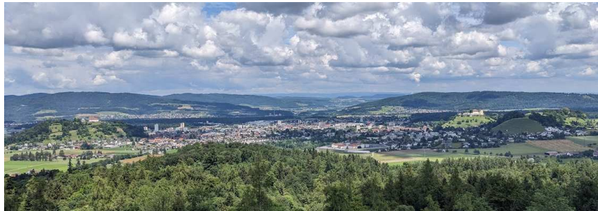
Institute Hike: View from the Esterlitem.