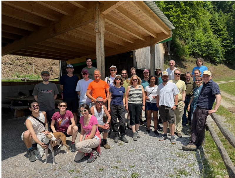
Institute Hike 2025, close to Schnebelhorn.